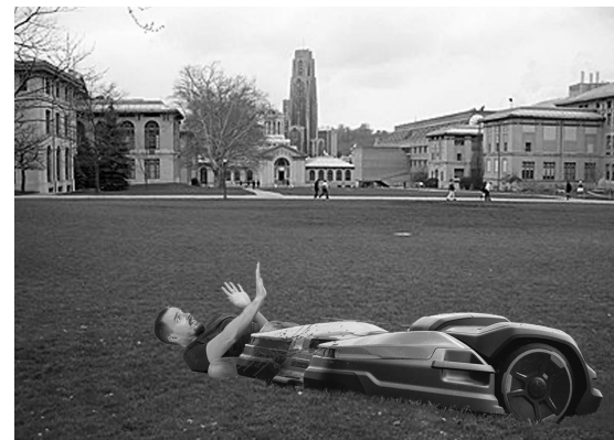
Distracted students continue to get eaten by the automower//Rock Buddy

STAY SAFE FROM HOME INVADERS. LIGHT YOUR FIREPLACE.